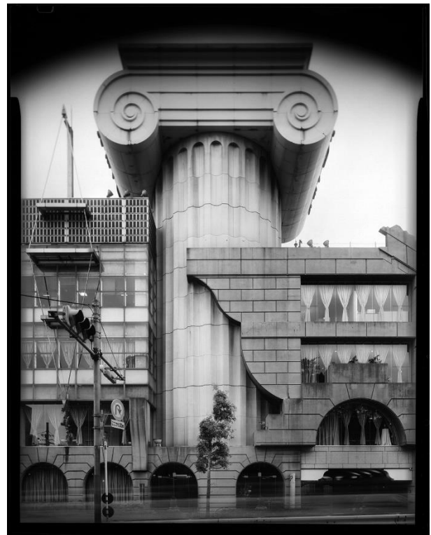
Kengo Kuma, M2 Building, 1992 Tokyo

Photographer Vincent Feldman's richly toned photographs of Philadelphia's architectural legacy, once commanding structures now neglected and deteriorating, reveal the tragic loss of the city's proud ideals of civic life. In his award-winning book City Abandoned: Charting the Loss of Civic Institutions in Philadelphia , Feldman lovingly depicts these structures suffering the effects of the city's decades-long policy of federal redlining, disinvestment, and failure to enforce its historic preservation codes and policy. His portraits of Philadelphia, once the center of American history, politics, culture and industry, ask how the city, lauded as "the Athens of the Western World" in 1811, became a careless steward of its powerful legacy. Feldman will discuss his large-scale architectural photographs of Philadelphia along with his new body of work, Tokyo Mo-dan: The Enduring Legacy of Modern Architecture in Tokyo , the largest extant survey of historical works of Western style buildings in Tokyo.