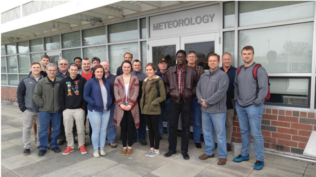
Attendees at the Unidata Regional Python and AWIPS CAVE Training Workshop held at Millersville University in April.